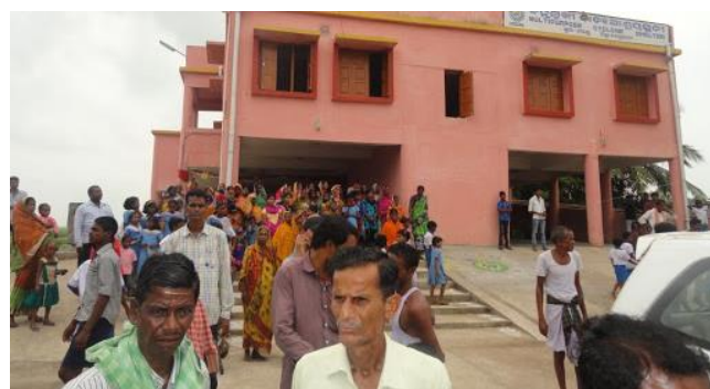
Shelters have helped save lives from weather disasters, but could serve as incubators for COVID-19

Disasters act on and exacerbate existing vulnerabilities which are often linked to gender, age, ethnicity, income, health and nutritional status, amongst other factors. COVID-19 has already proven to impact certain groups disproportionately for both epidemiological and socio-economic reasons iii . The twin impact of disasters and COVID-19 will have a far more adverse effect on groups that are already marginalised and vulnerable. At the same time, existing social protection measures are often not agile enough to respond to the needs of vulnerable individuals and households. In India, a substantial number of poor are excluded from social safety nets for various reasons, such as lack of appropriate identification to get a ration card iv .