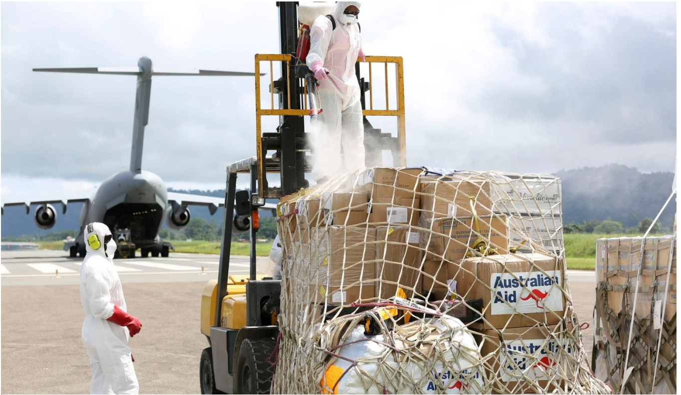
Some donor governments are already putting in place steps to ensure humanitarian relief is disinfected and does not expose the recipient to COVID-19